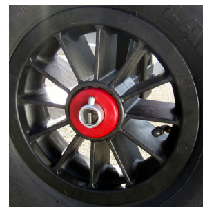
Snap Button Immobilized