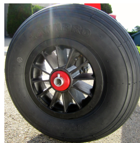
Unsecured Snap Button