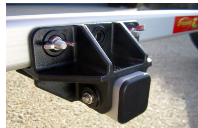
Wing nuts for quick disconnect